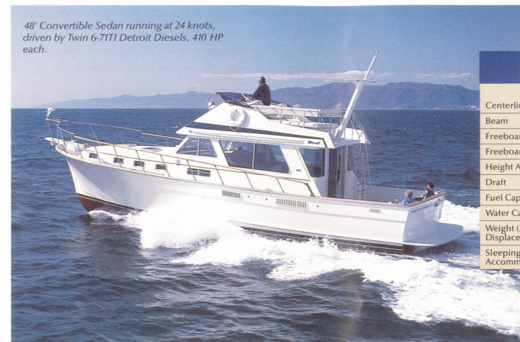
48' Convertible Sedan running at 24 knots, driven by Twin 6-71N Detroit Diesels, 410 HP each.