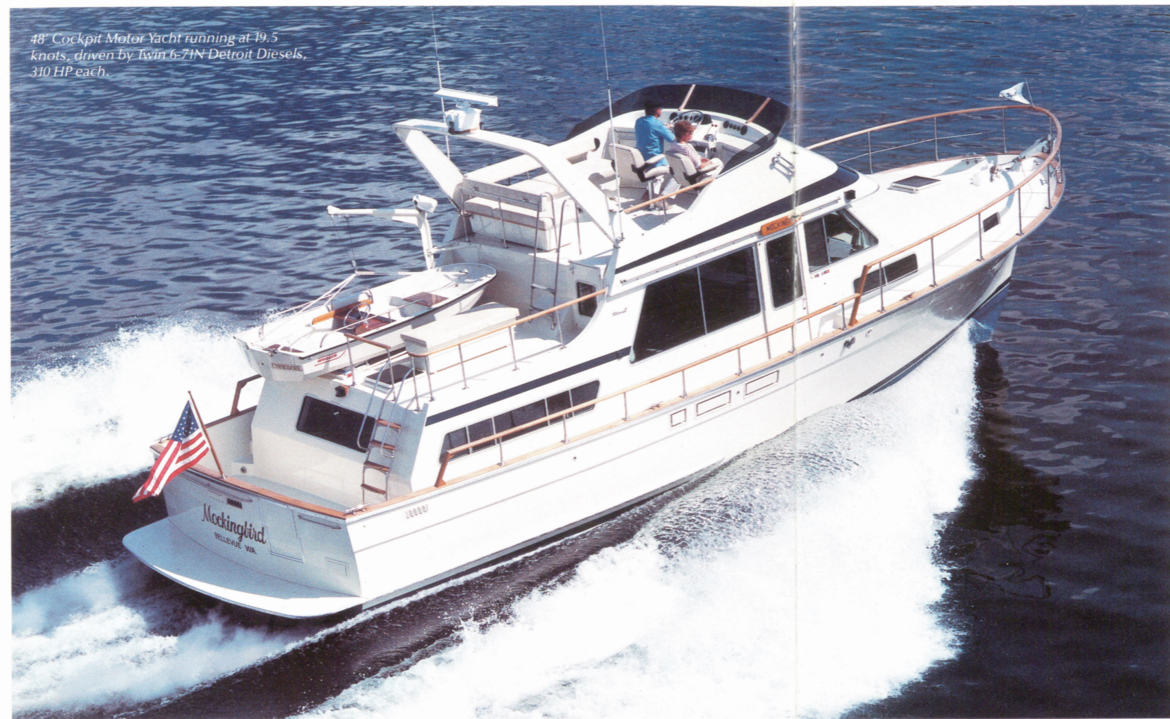
48' Cockpit Motor Yacht running at 19.5 knots, driven by Twin 6-71N Detroit Diesels, 310 HP each.

Up top, you'll find a spacious bridge with plenty of seating for you and your guests. Teak